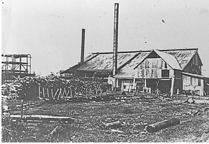
Benowa Sugar Mill